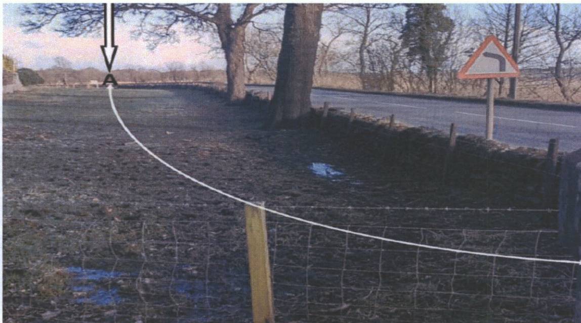
Photograph 4 – Looking East towards site access junction (Point A)

I have also witnessed on occasions members of the church congregation standing by the entrance to the junction waiving fellow parishioners back onto the road due to the poor visibility and the speed at which some vehicles travel along this route.