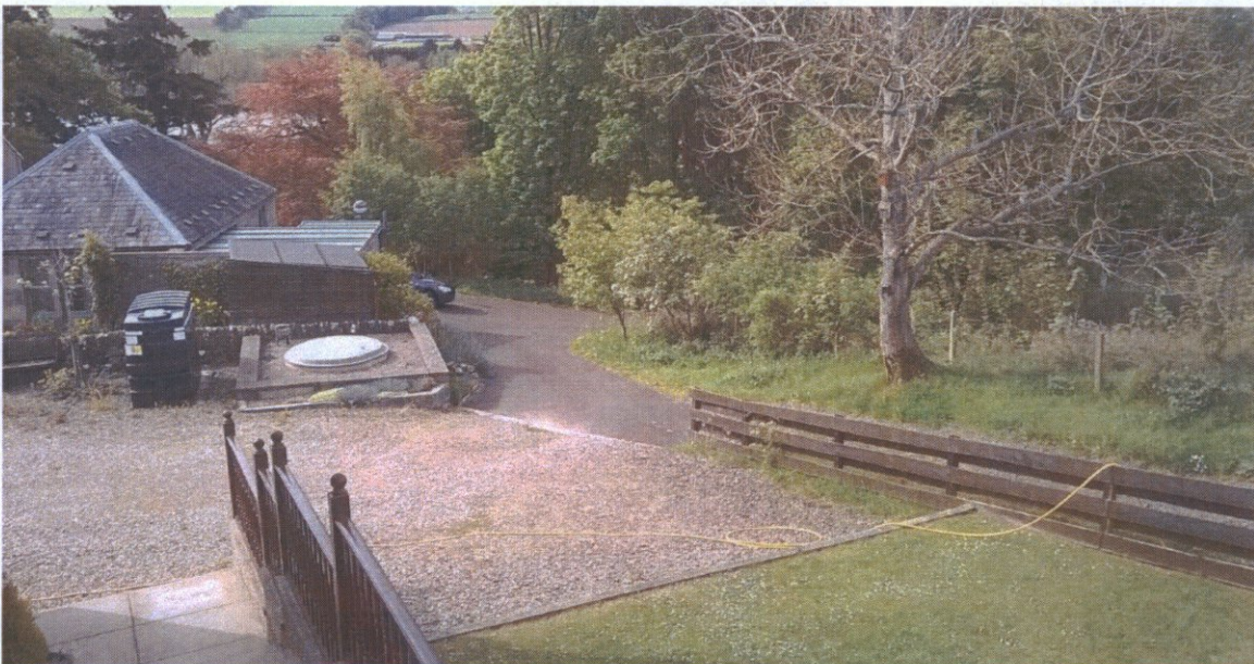
Access from my drive in the Summer

If a new house was built provision would have to be made for car passing spaces along the track. The access track is on an extremely steep gradient, impossible to reverse up and precarious to descend especially in winter. If the track is covered in snow I have no control over my vehicle once I leave my drive and it results in me sliding down the track until I come to a natural stop (even in a 4 wheel drive). This is manageable at the moment as there is only one other property with one other car to contend with but any additional increase in traffic would cause a problem.