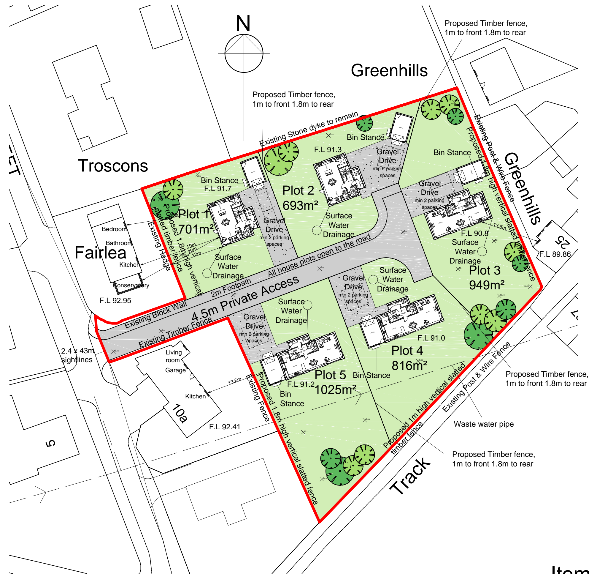
Site Plan - Scale 1.500