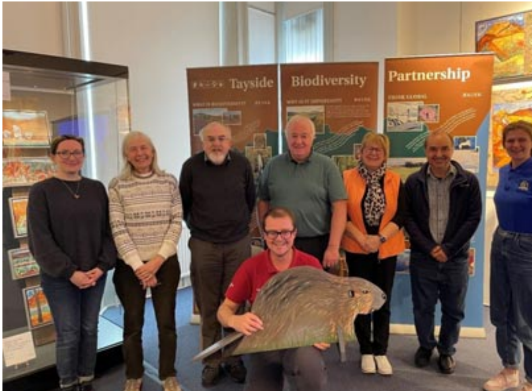
Photo: a selection of speakers from the Tayside Recorders' Forum 2023 held at Montrose Museum and Art Gallery