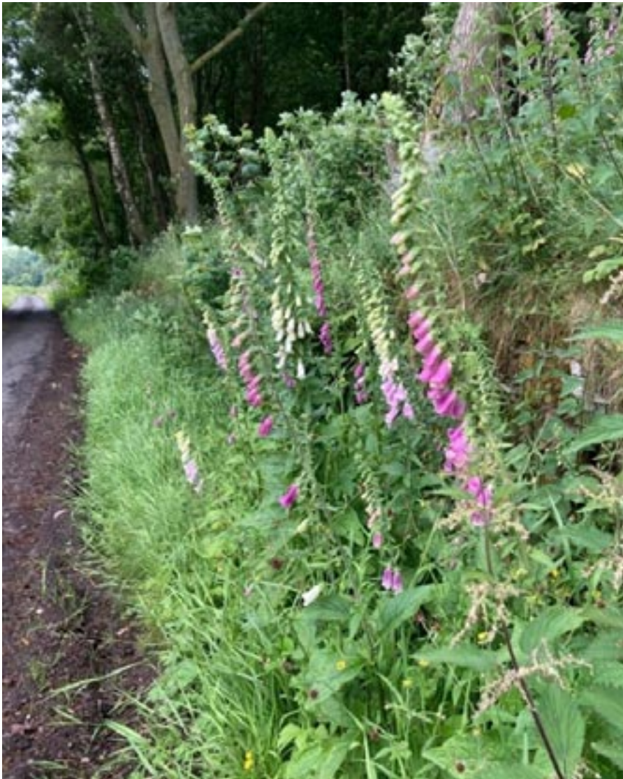
Photo: Roadside verge management Kinnettles pilot study © Kelly Ann Dempsey.

The pilot of the verge cutting regime at Kinnettles is an example of good practice where one cut was carried out in autumn 2022 and again in 2023 but with the addition of passing places in suitable locations in 2023.