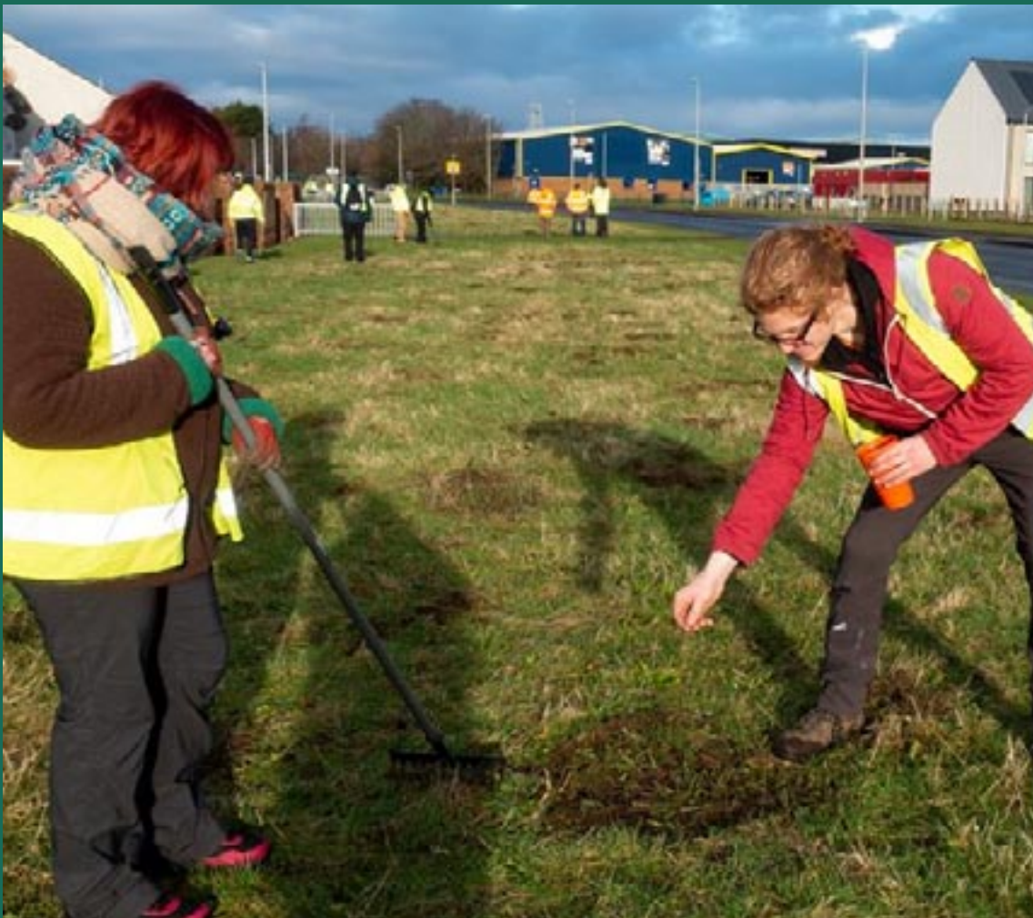
Photo: Volunteers sowing Yellow Rattle in Montrose.