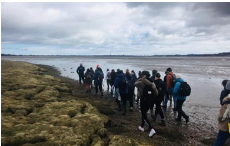
Photo: Aberdeen University visit Montrose Basin LNR

During 2021 and 2022, an ANGUSalve ranger based at Montrose Basin LNR worked in partnership with Scottish Wildlife Trust to run a series of events. Activities include educational group visits including University and higher education groups, joint guided walks, and site-specific events allowing interpretation of the key species and habitats within the reserve.