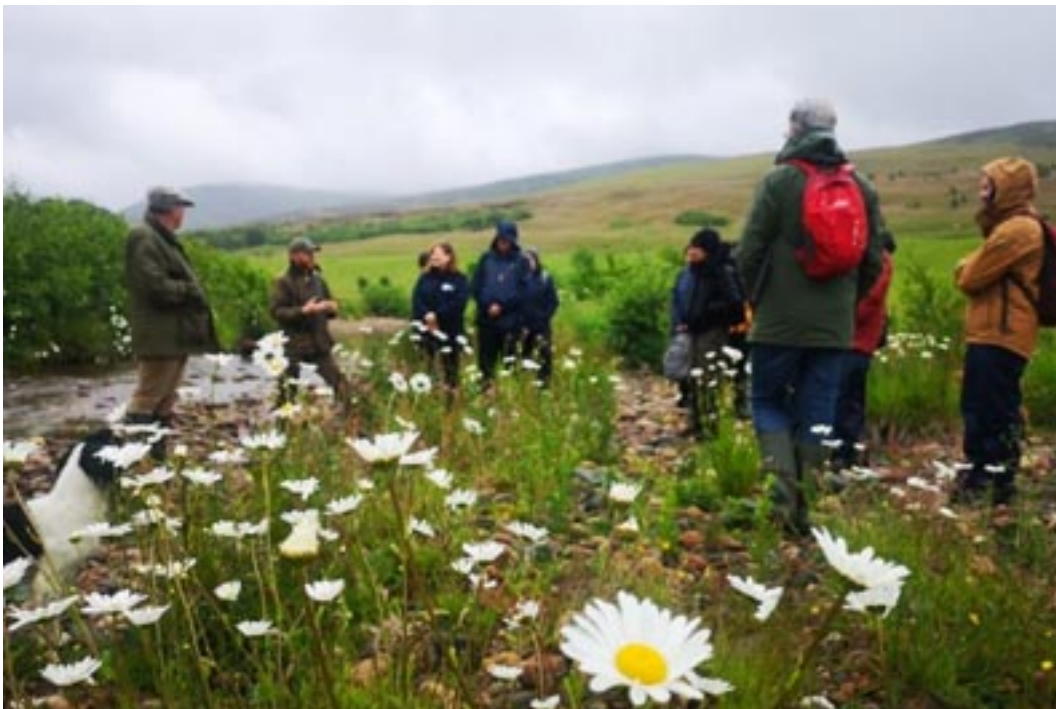
Photo: Restoring the Rottal Burn sharing good practice event

The 'Restoring the Rottal Burn' project was awarded the UK River Prize in April 2023 by the River Restoration Centre. The project is an example of what can be achieved when local partners, experts, academics and landowners combine their strengths for the benefit of the local environment, biodiversity, and community. More so than ever, 10 years post restoration the project continues to inspire new restoration projects across the River South Esk catchment and Angus.