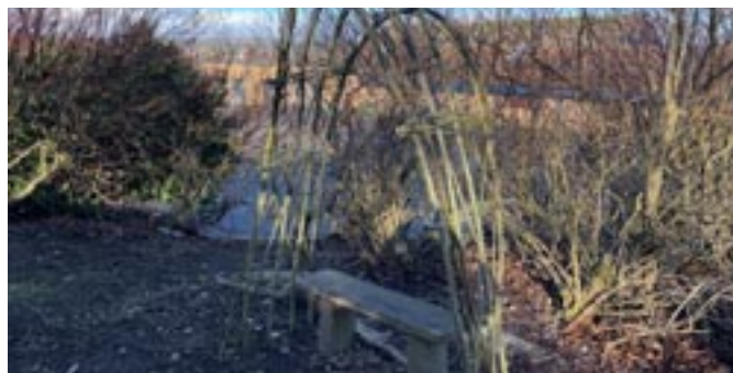
Birkhill Primary School Jubilee tree planting and willow feature